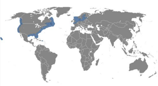
0.1% Sulphur in 2015